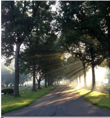
Summer 2013, early morning Centennial Drive Riverside Cemetery

A Publication of the Riverside Cemetery Association and Foundation