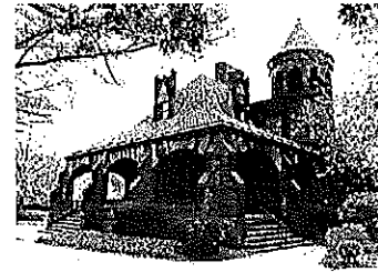
Riverside Cemetery Office