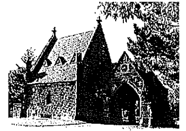
William R. Halley Chapel