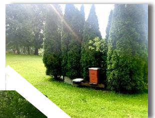
Above: honeybee hive as seen from too close