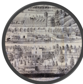
1874 drawing of the Brainard family farm.