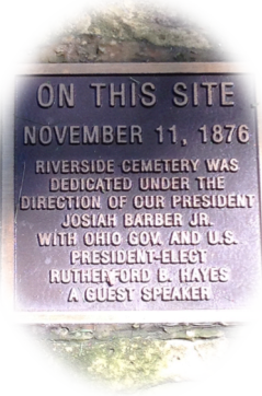
Dedication plaque located at Riverside's Centennial Drive Circle