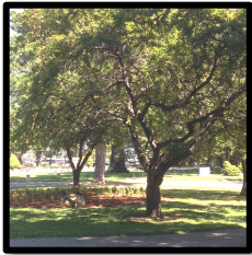
Present-day photo of the dedication site at Riverside's Centennial Drive Circle