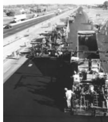
Left: I-71, also known as the Medina Freeway, during its early construction days. A portion of this highway now runs directly to the north of Riverside Cemetery.

The highway projects extended well into the 1970's as the cemetery adjusted to the new traffic, replaced drainage and landscaping, and finished other projects left after the state's work on the highway was complete. In all, Riverside lost around fourteen acres, as well as some of its historically scenic surroundings. However, fifty years later Riverside still has ample room for future burials. Plus with the addition of a new highway so close, Riverside is easily accessed by families all over Northeast Ohio area, and greets travelers commuting to and from downtown as a landmark, connecting Cleveland's natural landscape to its industry, and its history to today.