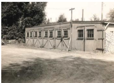
The picture above was the Service Garage and the picture to the right was caretaker's residence, both of which were torn down to make room for the I-71 entrance ramp.