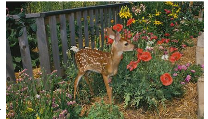
While it's hard to say no to this little guy, sometimes choosing the right flowers and treating with repellent is the best way to keep animals out of your plantings. Tulips are among a deer's favorite.

Another thing to consider is wildlife resistant plants. Animals find their way into greenspaces just like people do. Using deer repellent on your plants, or choosing deer resistant plants like Hyacinth tend to help keep animals from munching. Other good plants can include daffodils, lilacs, iris, and geraniums. Deer tend to be attracted to tulips, roses, and hostas.