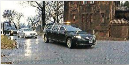
ABOVE: The procession of the symbolic service passes the Riverside Gatehouse on its way to Section 3.