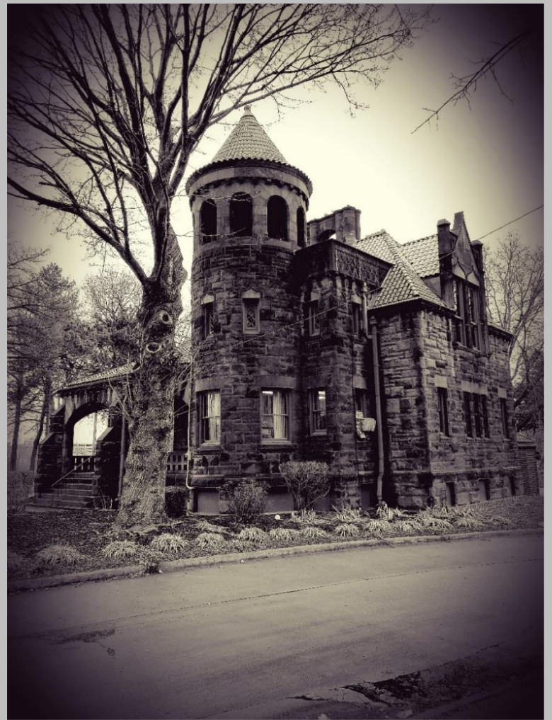
Above: The Administrative Building at Riverside Cemetery