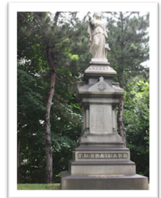
Riverside Cemetery was made possible by the purchase of 102½ acres of land, in 1875, from Titus N. Brainard.

"Cultural Landscapes provide a sense of place and identity, mapping our relationship with the land over time, and are part of our national heritage and each of our lives."