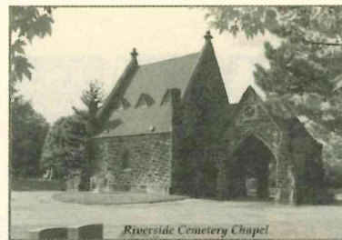
Riverside Cemetery Chapel